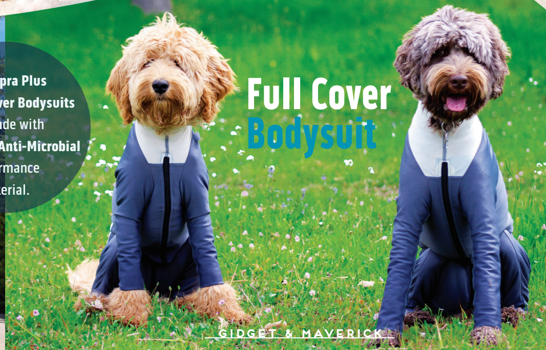
GIDGET & MAVERICK

Our Supra Plus and Full Cover Bodysuits are made with MICROBlok Anti-Microbial performance material.